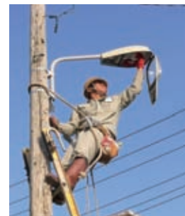
OEPC employees inspecting street lights