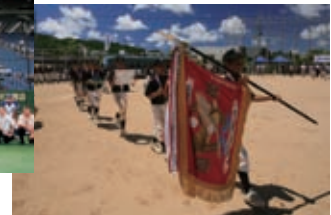
Okiden Pennant Elementary School Baseball Tournament