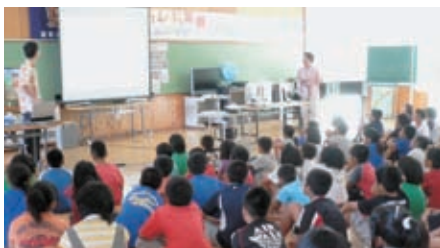
An OEPC staff member gives a talk on environmental and energy topics to elementary school children

OEPC also contributes to the development of sport events in Okinawa. The Company participates in the staging of numerous sports events for the next generation of Japanese citizens, including the Okiden Pennant Tournament — a rubber-ball baseball competition for elementary school children — and "30 kids on 31 legs" races (a much-expanded version of the three-legged races we are familiar with in the West) between elementary school classes. The Company also supports and sends voluntary workers to a variety of sporting events that can be participated in by people of all generations, such as the "NAHA Marathon."