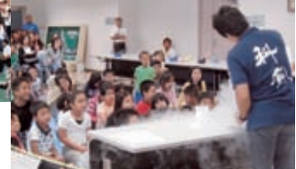
A "make it together with Mom and Dad" class