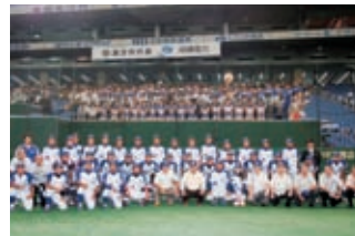
The OEPC baseball team

OEPC has been contributing to the development of the arts and cultural activities in Okinawa. The Company provides support for a variety of artistic and cultural events held in the prefecture, such as those related to Ryukyu dance and Eisa. In addition, the Company organizes the "Okiden Sugarhall Audition for Debut Concert" and the "Okiden 'Landscape with Light' Digital Photo Contest."