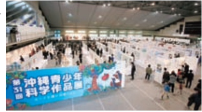
The Okinawa Young People's Science Fair