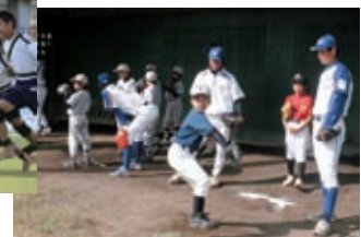
Baseball workshop for children