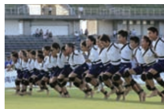
The "30 kids on 31 legs" race