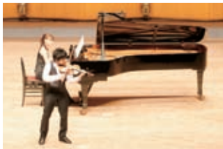
The Okiden Sugarhall Audition For Debut Concert

We support a variety of academic and educational events to foster an understanding of the pleasure to be derived from learning, and to develop a love of creating things among schoolchildren, who will form Okinawa's work force in future years. We also organize the Okinawa Young People's Science Fair to help schoolchildren feel the fascination of science. We also provide a variety of opportunities for educating children. For example, we organize tours for schoolchildren of our Electrical Science Museum and our power stations, where they can enjoy learning how electricity works, and hold "make it together with Mom and Dad" classes.