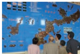
A guided tour of the Company’s facilities

Every November, OEPC holds “Get to Know Okiden” events to express its gratitude to the regional community and customers through sincere interactions with them. These events, held at all OEPC branches and offices, include discussion sessions with members of the public, sports competitions and community volunteer initiatives undertaken by our employees.