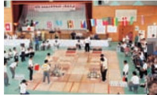
A robot building and control competition for high school students