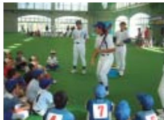
Baseball workshop for children