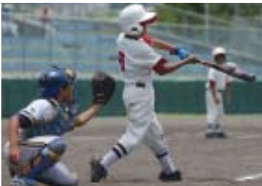
The Okiden Pennant Tournament, a rubber-ball baseball competition for elementary school children

In the field of sports, we sponsor a number of competitive events, including the Okiden Pennant Tournament - a rubber-ball baseball competition for elementary school children - Naginata martial arts tournaments, and the OEPC Cup table tennis team tournament (open to the general public).