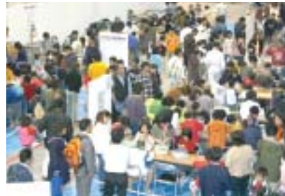
The Okinawa Young People’s Science Fair

In order to foster an understanding of the pleasure to be derived from learning, and develop a love of creating things among schoolchildren, who will form the nation’s work force in future years, we organize a robot-building competition for high school students and an exhibition of science-work by the students. We also organize tours for schoolchildren of our Electrical Science Museum and our power stations, and hold a “science fair classroom” for students and their parents during the summer holidays.