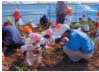
Potato planting for children

Every November, over a period of ten days, the Company organizes a variety of events to help local people get to know the Company better. The events include talk sessions with members of the public, guided tours of our power plants, sports competitions, and community volunteer initiatives by our employees.