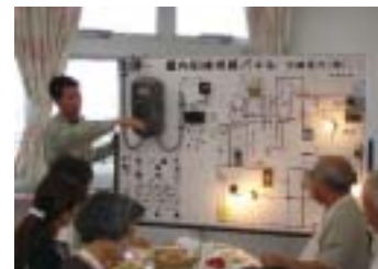
A "Learn About Electricity in the Home" class for local residents