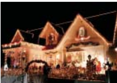
An entry in the contest for the Okiden Illumination Prize