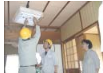
Checks and repairs on wiring in homes where elderly people live alone