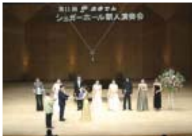
The Okiden Sugar Hall Newcomers' Performance Audition